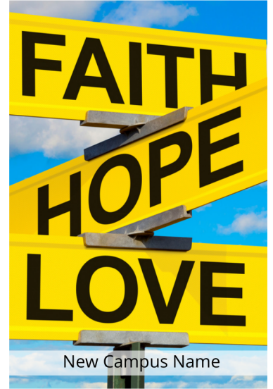
New Campus Name