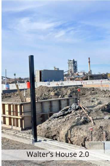
Walter's House 2.0